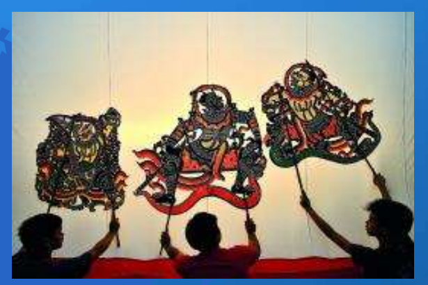
"Ratchaburi Shadow Puppet Museum (Wat Khanon)" By Mr.Niwat Tantayanusorn, Ph.D. [CC BY-SA 4.0 (https://creativecommons.org/licenses/by-sa/4.0)], via Wikimedia Commons; https://commons.wikimedia.org/wiki/File:Ratchaburi_Shadow_Puppet_Museum (Wat Khanon) 3.jpg