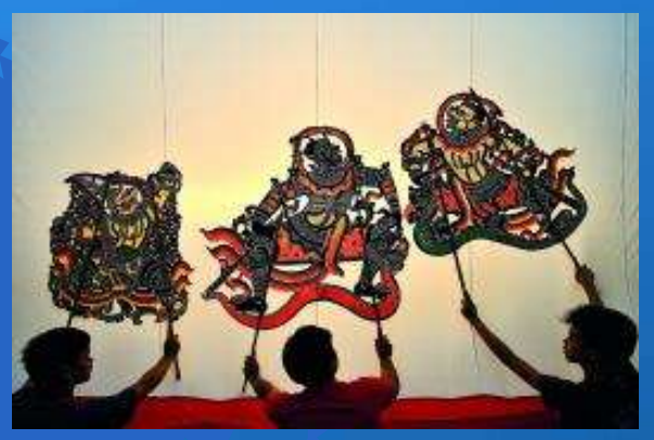
"Ratchaburi Shadow Puppet Museum (Wat Khanon)" By Mr.Niwat Tantayanusorn, Ph.D. [CC BY-SA 4.0 (https://creativecommons.org/licenses/by-sa/4.0)], via Wikimedia Commons; https://commons.wikimedia.org/wiki/File:Ratchaburi_Shadow_Puppet_Museum (Wat Khanon) 3.jog