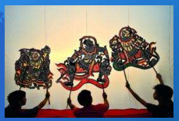
"Ratchaburi Shadow Puppet Museum (Wat Khanon)" By Mr.Niwat Tantayanusorn, Ph.D. [CC BY-SA 4.0 (https://creativecommons.org/licenses/by-sa/4.0)], via Wikimedia Commons, https://commons.wikimedia.org/wiki/File:Ratchaburi_Shadow_Puppet_Museum (Wat Khanon) 3.jpg

The "intangible cultural heritage" means the practices, representations, expressions, knowledge, skills – as well as the instruments, objects, artefacts and cultural spaces associated therewith – that communities, groups and, in some cases, individuals recognize as part of their cultural heritage. This intangible cultural heritage, transmitted from generation to generation, is constantly recreated by communities and groups in response to their environment, their interaction with nature and their history, and provides them with a sense of identity and continuity, thus promoting respect for cultural diversity and human creativity. For the purposes of this Convention, consideration will be given solely to such intangible cultural heritage as is compatible with existing international human rights instruments, as well as with the requirements of mutual respect among communities, groups and individuals, and of sustainable development.