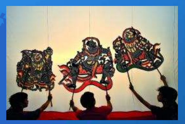
"Ratchaburi Shadow Puppet Museum (Wat Khanon)" By Mr.Niwat Tantayanusorn, Ph.D. [CC BY-SA 4.0 (https://creativecommons.org/licenses/by-sa/4.0)], via Wikimedia Commons; https://commons.wikimedia.org/wiki/File:Ratchaburi_Shadow_Puppet_Museum_[Wat_Khanon]_3.jpg

Within the framework of its safeguarding activities of the intangible cultural heritage, each State Party shall endeavour to ensure the widest possible participation of communities, groups and, where appropriate, individuals that create, maintain and transmit such heritage, and to involve them actively in its management.