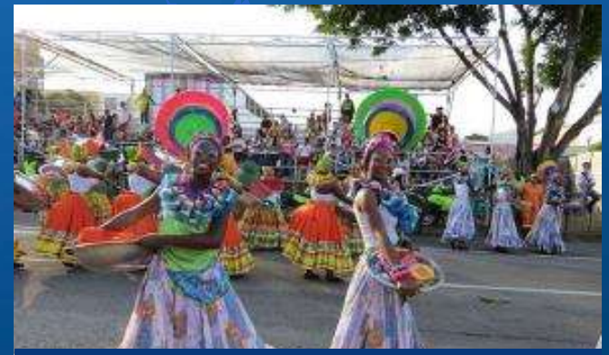
Carnival, Kolumbien; "CARNAVAL DEL CALI VIEJO EN LA FERIA DE CALI 2015"