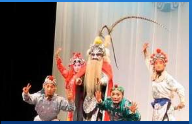
Peking Opera, China

The intangible cultural heritage – or living heritage – is the mainspring of our cultural diversity and its maintenance a guarantee for continuing creativity