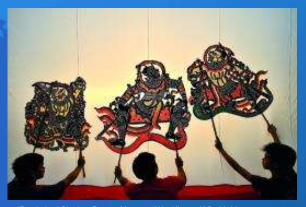
"Ratchaburi Shadow Puppet Museum (Wat Khanon)" By Mr.Niwat Tantayanusorn, Ph.D. [CC BY-SA 4.0 (https://creativecommons.org/licenses/by-sa/4.0)], via Wikimedia Commons, https://commons.wikimedia.org/wiki/File:Ratchaburi_Shadow_Puppet_Museum (Wat Khanon) 3.jpg

In order to ensure better visibility of the intangible cultural heritage and awareness of its significance, and to encourage dialogue which respects cultural diversity, the Committee, upon the proposal of the States Parties concerned, shall establish, keep up to date and publish a Representative List of the Intangible Cultural Heritage of Humanity.