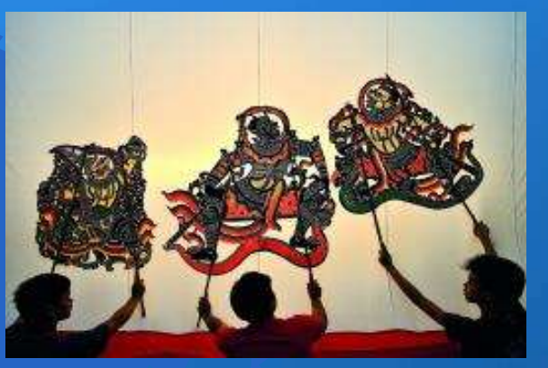
"Ratchaburi Shadow Puppet Museum (Wat Khanon)" By Mr.Niwat Tantayanusorn, Ph.D. [CC BY-SA 4.0 (https://creativecommons.org/licenses/by-sa/4.0)], via Wikimedia Commons, https://commons.wikimedia.org/wiki/File:Ratchaburi_Shadow_Puppet_Museum (Wat Khanon) 3.jpg