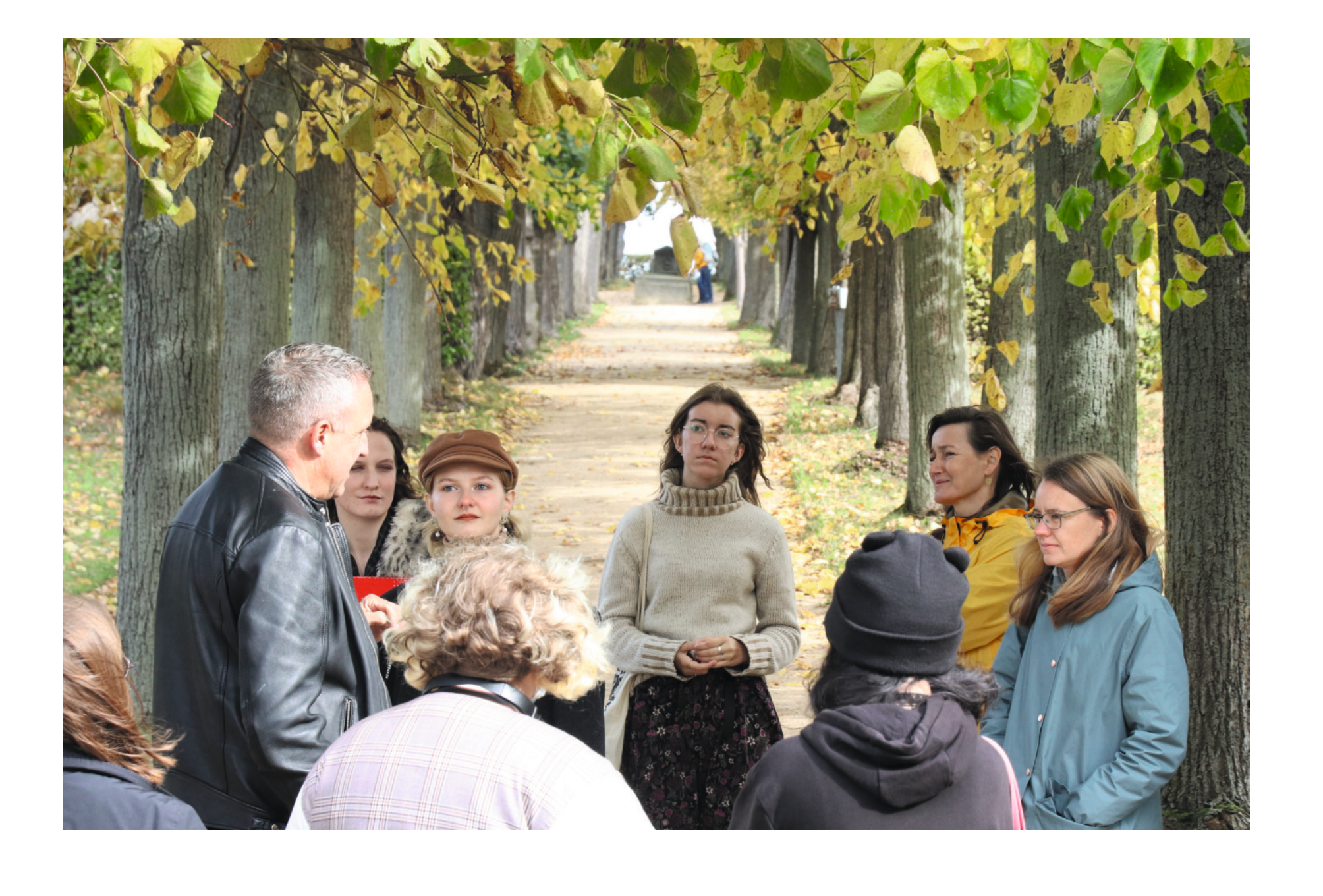
Photo top left: Palaces and Parks of Potsdam and Berlin in times of climate change

Photo bottom right: Experiencing history, landscape, nature and traditions in Herrnhut